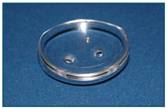
Close up of Ocular Conformer

There is a six-to-eight-week waiting period before you can be fitted with your new eye prosthesis. This time allows for healing and swelling to go down. Be sure to meet or visit your Ocularist during this time so that the next stage can be explained and any questions answered.