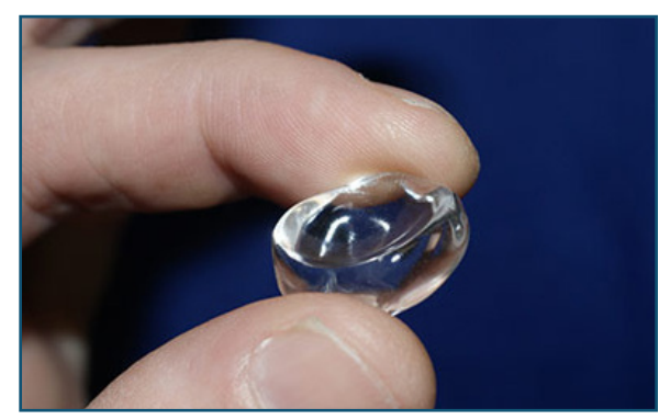
Example of a Custom Ocular Conformer

For some patients the Ophthalmologist will work with the Ocularist to make a temporary artificial eye which functions as a intra-healing custom ocular conformer (worn while your eve socket is still healing). Sometimes a custom conformer is made after the eye socket has fully healed (six to eight weeks after surgery), instead of creating an eye prosthesis first. In this case the device would be considered a post-healing custom conformer and created when the Ocularist wants to shape the fornices (pockets of the eye under the lids) and other areas of the eye socket in preparation for the eye prosthesis so the final prosthesis will fit properly and look as